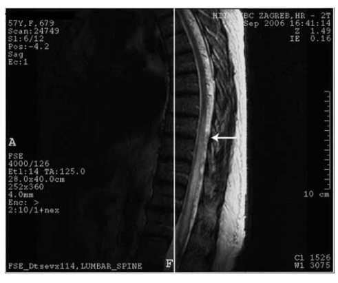
Fig. 4. Initial sagittal thoracolumbar MRI in FSE weigted images demonstrated high signal at the level Th8-th9 and an extensive intradural extradural arteriovenous malformation ascending over the dorsal thoracic cord from Th4-th11.

kle clonus brisk tendon reflexes on both sides. Babinski sign was positive on both side. Bladder felling was present, while there was no bowel feeling. The results of the laboratory processing revealed normal range and results of coagulation studies were unremarkable including lupus anticoagulant, anticardiolipin antibodies, factor V Leiden, PCR analysis for FII 20210A for FV R506Q. Only factor VIII was significantly elevated up to 2.05 IU/L. The results of a cerebrospinal fluid (CSF) evaluation were unremarkable. MRI investigations were conducted with a 2.0 T (GE Medical Systems) and control examination with a 3.0 T imager (Siemens) at the Croatian Institute for Brain Research, School of Medicine, University of Zagreb, Diagnostic Centre »Neuron«. Thoracolumbar MRI (Figure 4, 5 and 6) in T2-weighted images showed high signal at the level Th8-Th9 and an extensive intradural extradural arteriovenous malformation ascending over the dorsal thoracic cord from Th4-Th11. Selective spinal angiography of the radicular arteries from Th4 to Th5 demonstrated very gracile interlaced of abnormal spinal cord blood vessels constituing the discrete pial AVM. As the appearance of the feeding artery and AVM