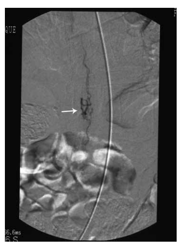
Fig. 2. Spinal angiography demonstrates arteriovenous fistula of the Adamkiewicz artery with extensive ascending and descending venous drainage (2006).