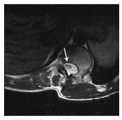
Fig. 1. Axial MRI in T2-weighted images shows atrophic thoracic spinal cord with intramedullary lesion within the conus medullaris restricted to the gray matter, consistent to the subacute myelopathy or Foix-Alajouanine syndrome (2006).

A 32-year-old man first developed lower limbs weakness and sphyncter disturbances when he was 14 years old. He became nearly paraplegic within a short period of time. Urinary retention and stool impaction were also noticed. Physical examination in September 1989 showed sensory impairment over Th8-Th12 level, with facilitated tendon reflexes and affected muscle power. Preoperative computerized tomography (CT) of the spine from 1989 revealed extensive and global thoracic and lumbar left side scoliosis. CT of the brain exhibited giant arachnoidal cyst in the frontomedial-temporobasal region. Aortography showed congenital renovascular anomaly, twofold larger right kidney, irrigated by two very broad renal arteries and hypoplastic left kidney irrigated by one hypoplastic renal artery and appropriate renal functions. An angiography was performed and the patient was diagnosed bering a arteriovenous fistula of the Adamkiewicz artery with extensive ascending and descending venous drainage. Repeated embolization of this malformation resulted in a clinicaly improvement and the patient was able to finish school and university, but complete recovery has not been achieved. Upon requestioning, the patient recalled several episodes of bilateral leg paraparesis. In September 2006, after 10 years break, he approached to the Cancer Institue Zagreb, because of progressing spasm of the lower extremities. At angio-