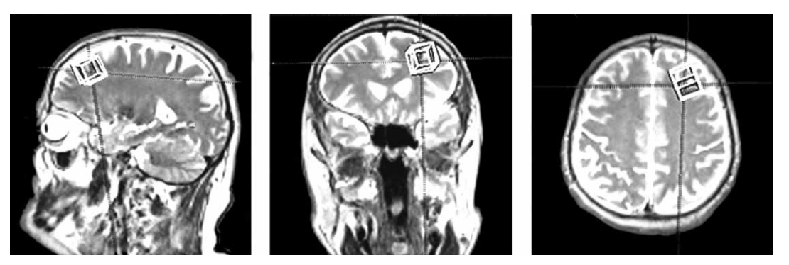
Fig. 1. Spectroscopic Volume of Interest (VOI) in the dorsolateral prefrontal cortex.

Following the above mentioned procedures, diagnostic MRI scans were done on a 3T MRI unit, to exclude potential cerebrovascular disease underlying the diagnosed clinical condition. Providing all of the above tests suggested diagnosis of AD and neuroradiological finding provided no proof of underlying cerebrovascular disease, subjects were diagnosed with AD. All subjects gave their voluntary informed consent, either themselves, or trough their caregiver, in case when their condition rendered them incapable of understanding the subject information sheet. Altogether 12 subjects (7 female and 5 male) were