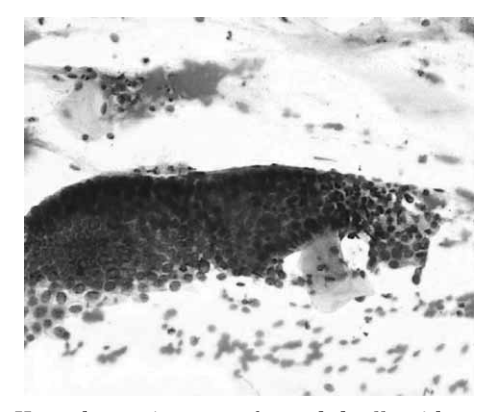
Fig. 3. Hyperchromatic group of crowded cells with scant cytoplasm and pseudosrtatification from glandular intraepithelial lesion grade 2. (Papanicolaou-stained cervical smear, ×100).

lar to but less pronounced than those in AIS. The type of desquamation is also similar, only the columnar cells are slightly packed showing a palisading pattern with mild pseudostratification, nuclear overlapping is less pronounced, and also feathering and rosettes are seen. Cell size is like that in normal findings or slightly enlarged. Nuclear size within a cluster varies to a greater extent than in AIS. The nucleus is round or oval, hyperchromasia is less pronounced, chromatin is finely granular and evenly distributed, and nucleoli are small and round. Mitoses are rare. Background is usually clean (Figures 2 and 3).