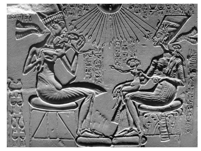
Fig. 1. Akhenaten with his wife and daughters (Wikipedia com-

Our hypothesis is that Akhenaten was suffering of homocystinuria. In next section we will first make a critical review of up-to-date theories and then we will explain advantages and disadvantages of our theory.