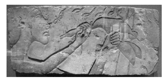
Fig. 2. Akhenaten is sacrificing a duck.