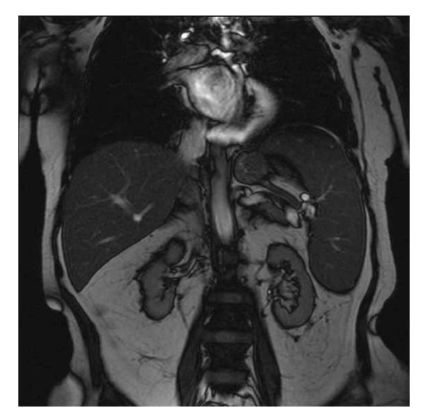
Fig. 4. Magnetic Resonance Imaging (MRI) finding of splenomegaly.