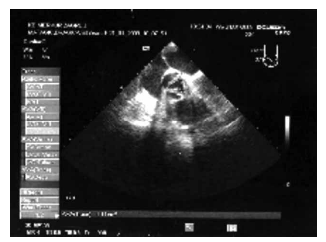
Fig. 1. Echocardiography of aortal value.

We report a female patient, with unremarkable family history and no previous medical history until the age of 30, when she presented with exertional dyspnea and syncope. Physical examination at that time revealed only abnormal heart sounds – murmurs compatible with aortic valve insufficiency. During next years of cardiological follow up, echocardiography revealed fibrotic changes of the