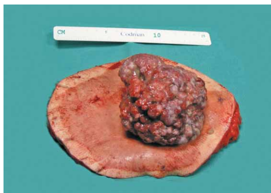
Fig. 3. Excision of the skin with the tumor on top, size 15,5 × 15 × 2 cm.

Pathohistological findings revealed regular epidermis on the surface of the excised erythematous skin that was surrounding the tumor. Tumor consists of nests of atypical epithelial basaloid cells with peripherally palisading cells. Stroma surrounds nests of tumor cells and in some nests keratinization is presented. Infiltration of skin was 1.5 cm and the surgical margins were negative. Tumor was completely removed (Figure 4).