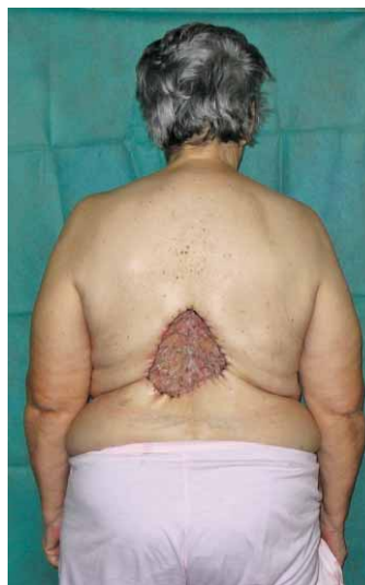
Fig. 5. On the defect of the skin Thiersch' graft was transplanted.

Excised skin defect was covered with split thickens skin graft from the right upper thigh (Figure 5). Three months after the surgery, wound is healing properly.