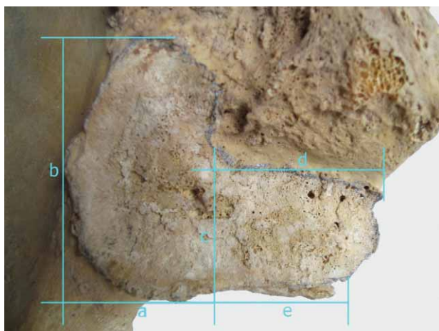
Fig. 2. Facies auricularis of the pelvic bone with measured parameters. a – width of vertical part, b – height of vertical part, c – height of horizontal part, d – cranial width of horizontal part, e – caudal width of horizontal part.

It was necessary to take more parameters besides the surface area, because of relatively large variety of shapes, so just the value of surface was not enough to create an image of facies auricularis , and especially it didn't pro-