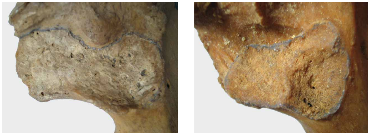
Fig. 1. Pelvic bone – facies auricularis .

tocks in approximately 15% of the population 5,6 . This pain doesn't have to be caused by some pathological change in the joint itself. Still, there is no reliable clinical method that could define stability of this joint 7 . Many radiological methods for defining pathological changes of this joint have been already described. But X rays can be as hurtful as useful for the patient so it is very important to use them as rarely as possible. That is why it is necessary to know the basic anatomy and biomechanic of this joint. The microscopic anatomy of this joint has been well researched, but for understanding the transfer of the forces it is important to know precise size of the surface of the joint's contact area, which is the goal of this study. It is important for simulations of the walk, results of biomechanical analysis and calculations of the transfer of the forces from the spine to hip joint.