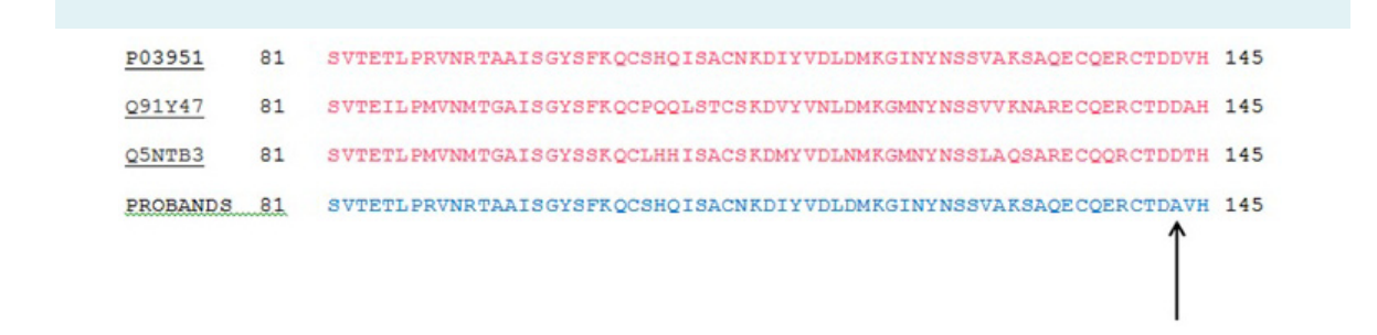
FIGURE 3. The location of the missense variant detected in the father and two daughters. The mutation site was referred against F11 or F11 homologue gene from Homo sapiens (P03951), Mus musculus (Q91y47), and Bos Taurus (Q5NTB3). The position of the missense mutation is marked by an arrow.

plex with high molecular fibrinogen (7). In FXI-deficient individuals, pathogenic variants are rarest in the Ap2 domain when compared with the other three apple domains (4).