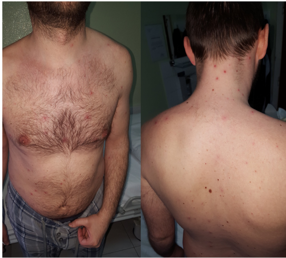
Fig. 1 Papular and vesicular rash on the neck and trunk

conditions and an increased occurrence of some other serious bacterial, fungal and certain viral infections [4–6].