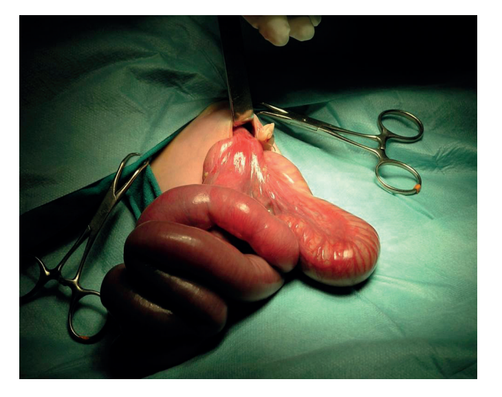
Fig. 2: Gastroschisis.