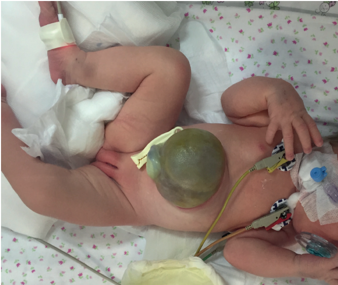
Fig. 3: Omphalocele.

Umbilical cord hernia belongs to the same group of defects that also includes omphalocele, and is often misdiagnosed as a small omphalocele (4, 5). The aim of treatment