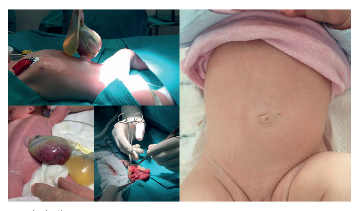
Fig. 1: Umbilical cord hernia.