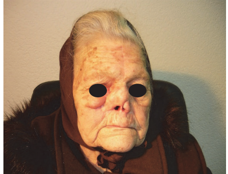
(d) Good aesthetic result nine months after surgery