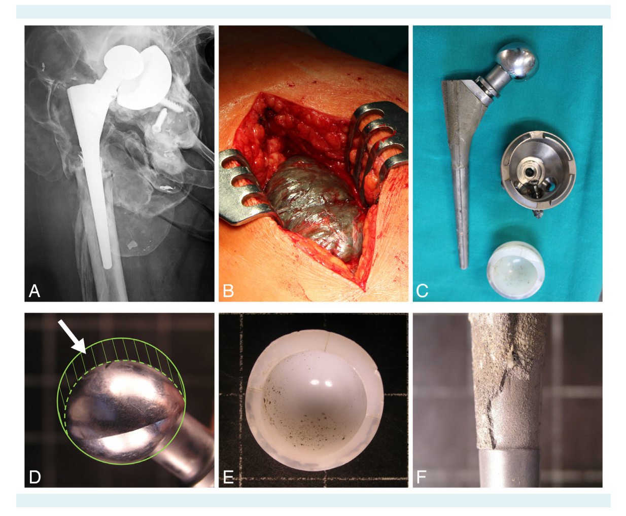
FIGURE 1. (A) Preoperative anteroposterior right hip x-ray showing acetabular cup dislocation, eccentric femoral head wear, "cloudy bubbles," and pseudotumor formation; (B) intraoperative image after a direct lateral approach to the right hip showing extensive metallosis; (C) intraoperative image of the extracted endoprosthetic components; (D) eccentric wear of the femoral head (posterior view, arrowhead pointing approximately at the worn part of the femoral head); (E) metal debris particles embedded in the acetabular polyethylene – most of the particles are embedded in the part of the liner that was not in contact with the worn femoral head; (F) damaged titanium porous coating on the extracted femoral stem.

A 56-year-old woman was referred to our outpatient clinic in 2018 because of pain and right hip decreased range of motion. She underwent a right-sided THA in 2001, when a modular neck implant and femoral stem with proximal titanium porous coating were used (acetabular cup: SPH-CONTACT; femoral stem: F2L Multineck; Lima Corporate, Villanova San Daniele del Friuli, Italy). Early postoperative period was uneventful. In 2012, the patient sustained right-sided trans-acetabular and inferior pubic ramus fractures, which were successfully treated conservatively. Since 2016 she complained about increasing pain in the right groin re-