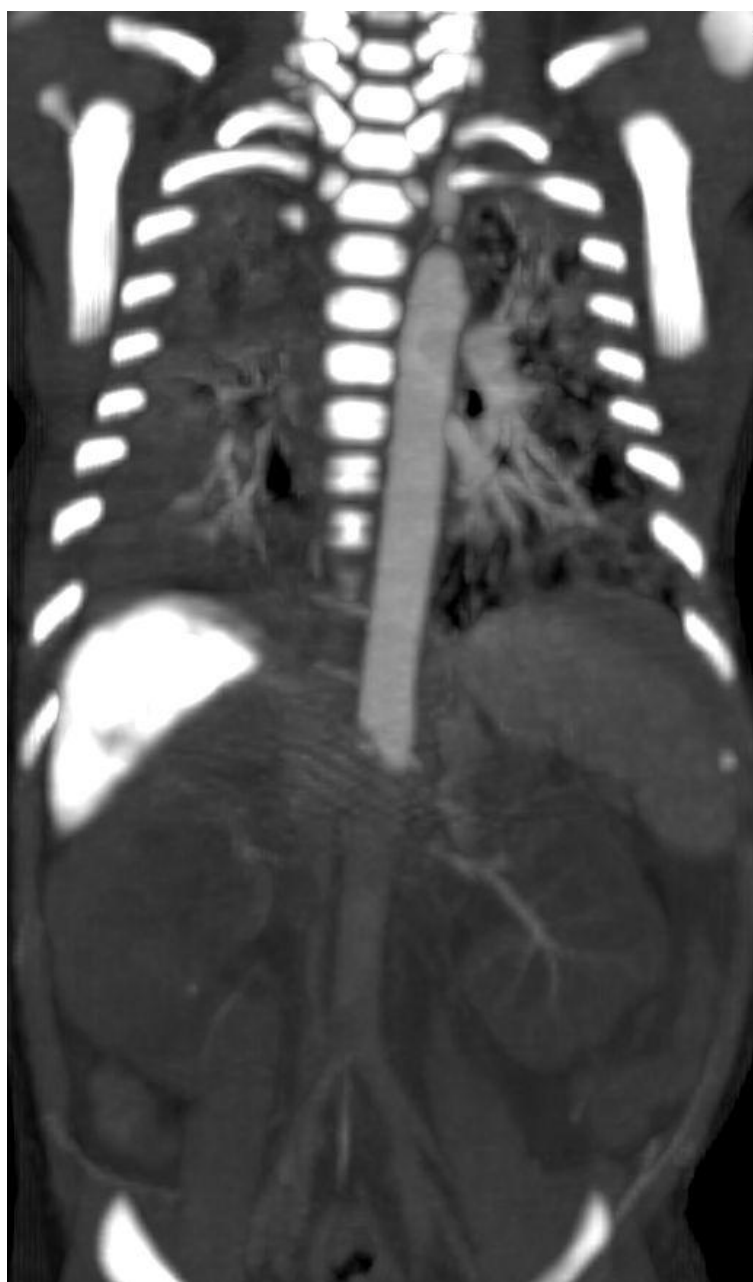
Figure 1. CT aortography showing thrombotic occlusion of the abdominal aorta from the level of celiac artery extending to both common iliac arteries. Both renal arteries ostia are occluded. Right kidney is edematous due to ischemia, and some collateral perfusion of the left kidney can be seen.