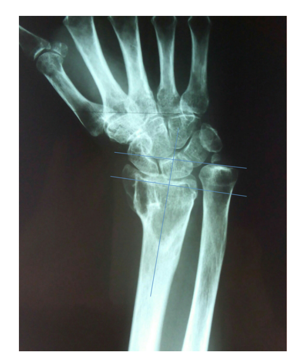
Fig. (1). Radio-ulnar variance measurement.