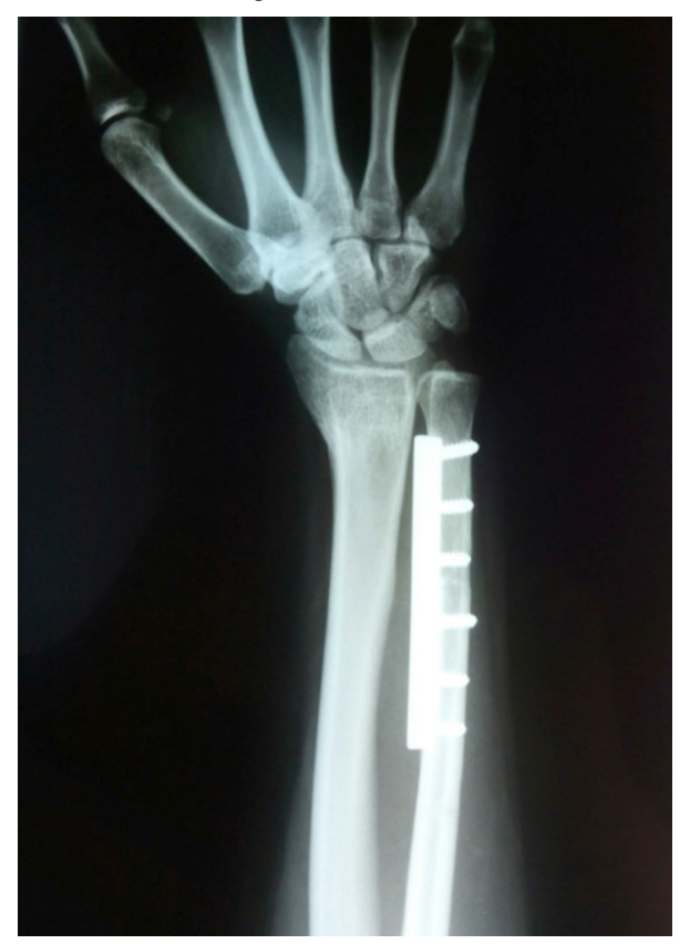
Fig. (2). Radiogram showing postoperative neutral radio-ulnar variance achieved.

Although corrective osteotomy of the distal part of the radius restores anatomical relations between distal radius and ulna it may often be technically difficult procedure [4, 5]. On the other hand, in some cases with minimal radial angulation that kind of procedure is even unnecessary. That is why ulnar shortening osteotomy (USO) has become the standard for correcting positive ulnar variance [6, 7]. Goal of the shortening procedure is to relieve the symptoms by reestablishing a neutral radio-ulnar variance (Fig. 2). Many authors described different options for this procedure in order to achieve the best possible functional results. In this paper we present a variety of surgical techniques available for USO, their advantages and drawbacks.