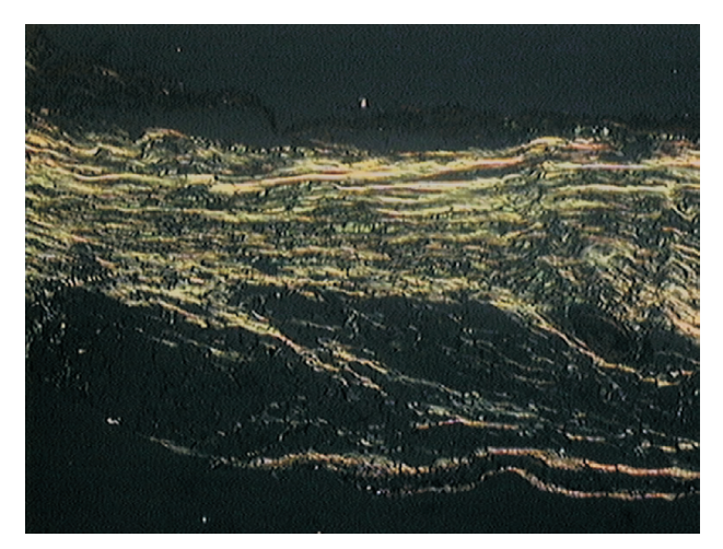
Fig. 2. Histologic examination of the aortal wall stained by Congo red demonstrating green birefringence under polarized light (Congo red, objective x2).

Histology of the aortic valve showed extensive hyaline degeneration, while the nature of the aortic wall pathology was consistent with reactive amyloidosis on Congo--red staining (Figure 2). Postprocedural systolic pulmonary artery pressures ranged from 45 to 55 mmHg. The