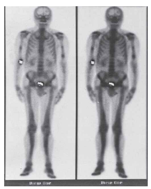
Fig. 5. Father's bone scintigraphy.

There are not many treatment options for such rare disease. One of them is etidronate, a first generation of bisphosphonate that inhibits osteoclast-mediated bone resorption. Etidronate is analog of pyrophosphate; when a carbon is substituted for the oxygen the molecule can