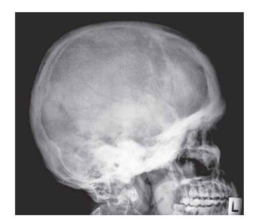
Fig. 3. Scull radiograms.