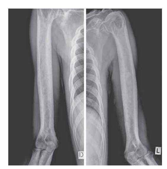
Fig. 2. Radiogram of right and left humerus.

The most difficult to distinguish from Camurati-Engelmann disease is Ribbing disease, sclerosing dysplasia of unknown etiology. Both diseases involve the diaphyses of long tubular bones with sparing of the epiphyses, but Ribbing disease is either unilateral or, if bilateral, always asymmetric <sup>12</sup>. Asymmetry of the bone involvement was not found in our patient. Ribbing disease is an adult condition with higher incidence in women, in contradiction with this case of male patient <sup>13</sup>. Finally, Ribbing disease