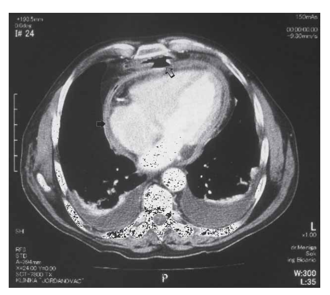
Fig. 3. MSCT scan of the thorax showing contrast in the pericardium (white arrow) and gastric tube (blank arrow). Note: bilateral pleural effusions.