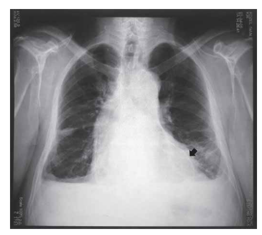
Fig. 1. Chest X-ray (AP) showing contrast extralumination into pericardium (black arrow).

Emergency reoperation was indicated. An attempt was made to suture the stomach ulcer through the right thoracotomy. It had to be abandoned however, after several attempts, due to the wall fragmentation and rigidity. The gastric tube was removed, the duodenum was blindly closed, esophageal cervicostoma was performed and permanent jejunostoma created. The colon was prepared for the scheduled coloplasty, after which the patient stayed at ICU for three weeks. Pleural cavity was rinsed with diluted Betadine solution several times a day. The patient was administered antibiotic therapy and antifungal therapy. Thoracic drain from the right chest was removed on postoperative day 10. After initial improvement and mobilization with normal nutrition via je-