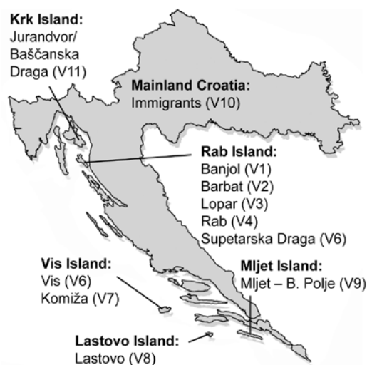
Figure 1. Geographic location of the investigated islands of Rab, Vis, Lastovo, and Mljet. Villages from 1 to 9 (V1-V9) are study populations. Immigrants into the islands originate from mainland Croatia (V10).

Assuming a polygenic nature of QTs and exponential distribution of effect size (30,31), the limited number of founders would initially introduce an unknown number of rare mutations (variants specific for their individual genomes) into the gene pool of the isolate they had established. Through such a “founder effect,” the frequency of those variants would thus increase from extremely rare in the general population (eg, f < 10^{-8} ) to common in that particular isolate ( f > 10^{-2} ). We present a hypothetical case of a geographic cluster of four such isolated populations that share similar environment and lifestyle (eg,